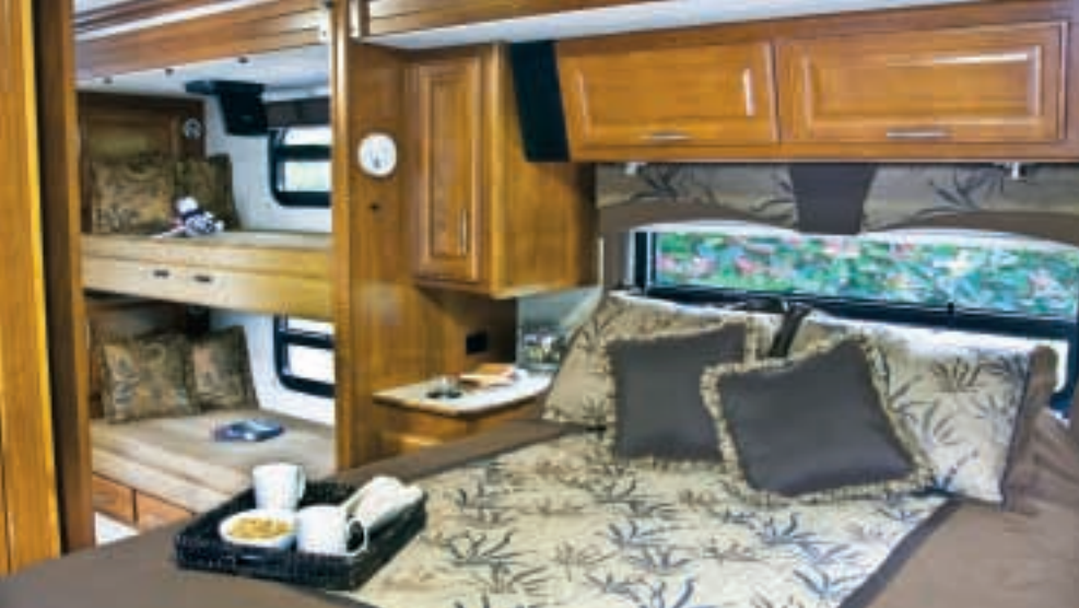
Above: A pillow-top innerspring mattress makes the queen-size bed comfy. In the next room, bunk beds are great for the kids or as extra storage space. Below: The Discovery made a perfect home base for my son's wedding at Sycamore Ranch RV Park in California.

The front kitchen plan limits the number of people who can socialize in the living area, but the cockpit seats swivel when extra company is on board. Overall, the living room is a very comfortable place to lounge and dine.